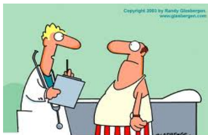
BONE DENSITY TESTS

"What fits your busy schedule better, exercising one hour a day or being dead 24 hours a day?"